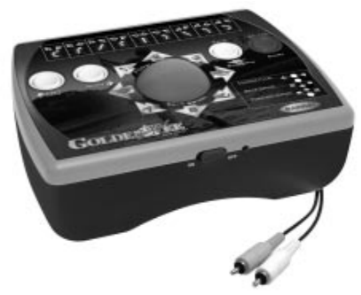
MODEL 76081 For 1 to 4 players / Ages 8 and up INSTRUCTION MANUAL